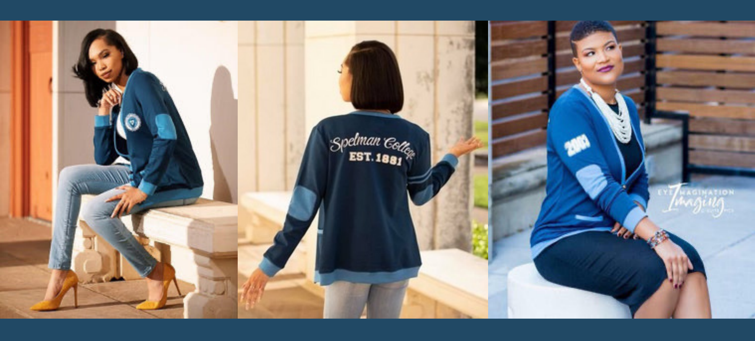
"The brand symbolizes grace, exquisiteness, and elegance...and serves to empower men and women."